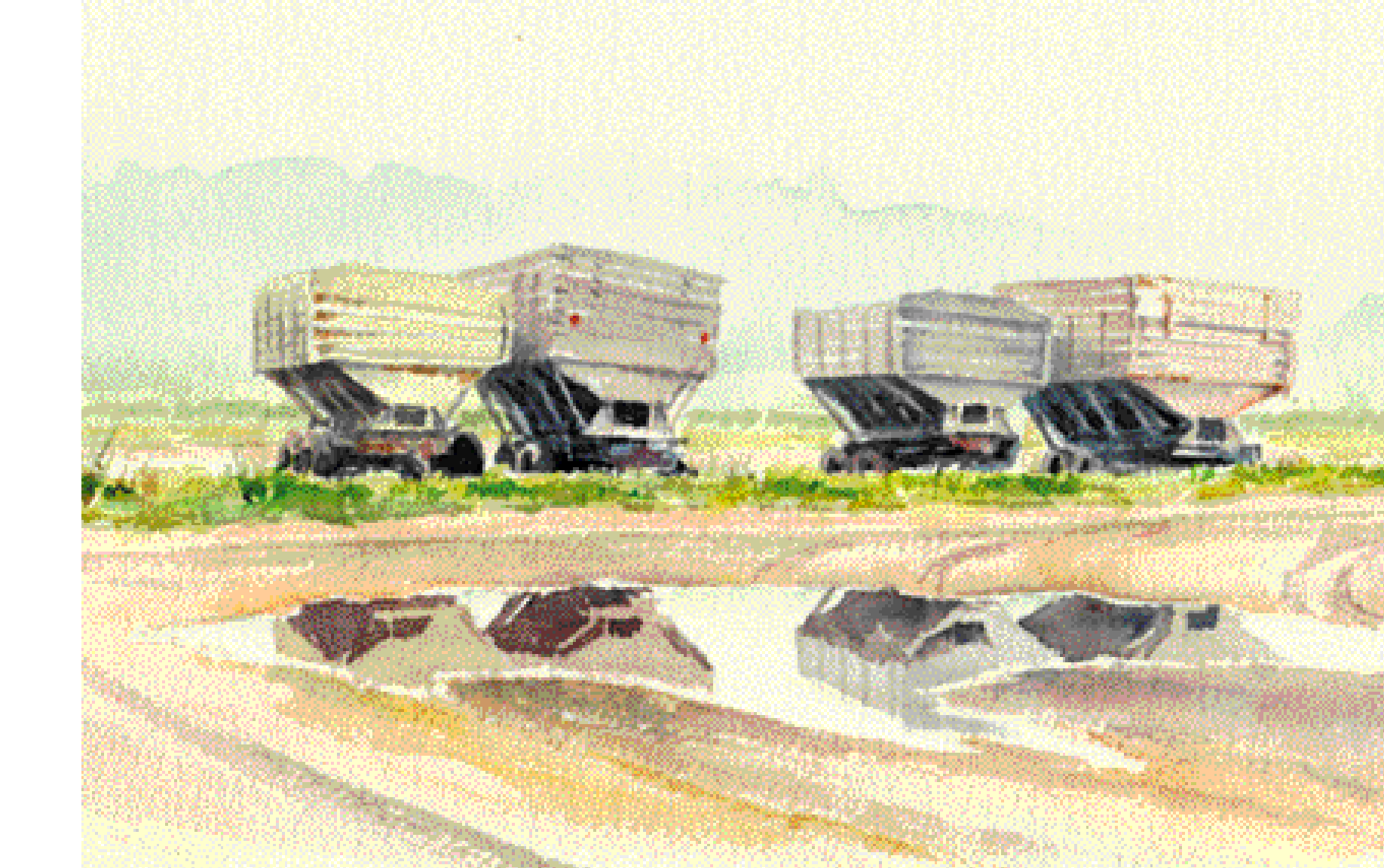
On its way north, the road passes idled crop wagons softened here by fog and gentle spring mists on the Schmidt Farm.